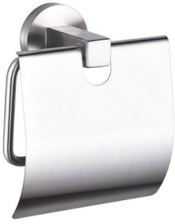
RAK92004 Stainless Steel